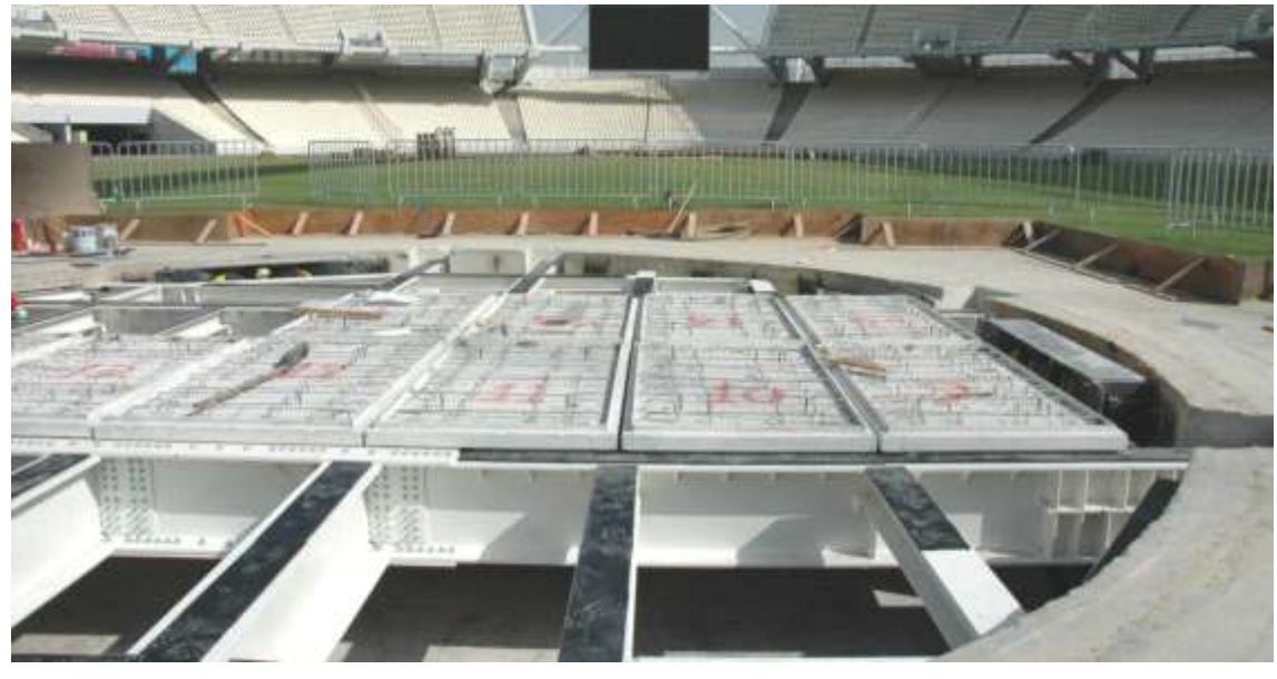
Concrete chamber for the opening ceremony of the Olympic games in the center of the stadium field. There can be discerned the elevator guides and the steel structure for the coverage of the chamber's roof