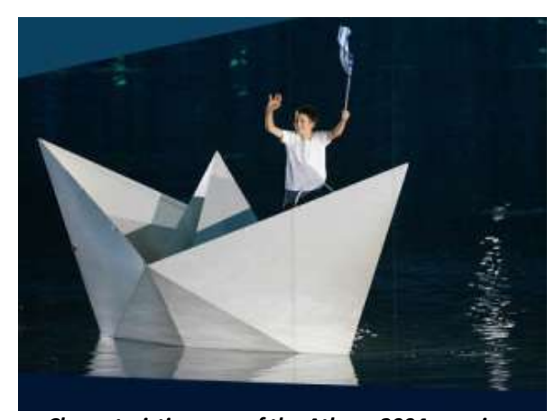
Characteristic scene of the Athens 2004 opening ceremony

All retaining piles were unanchored and were only connected at the top with a pile cap ring beam.